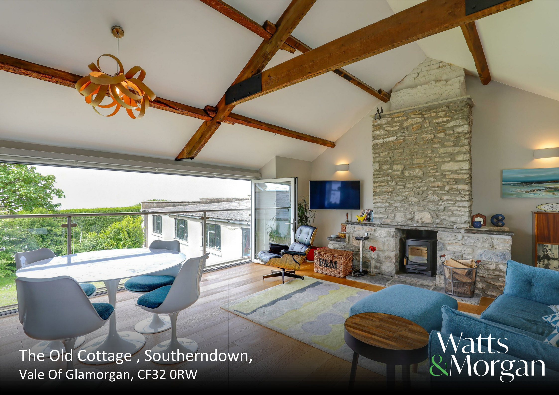
The Old Cottage , Southerndown, Vale Of Glamorgan, CF32 0RW